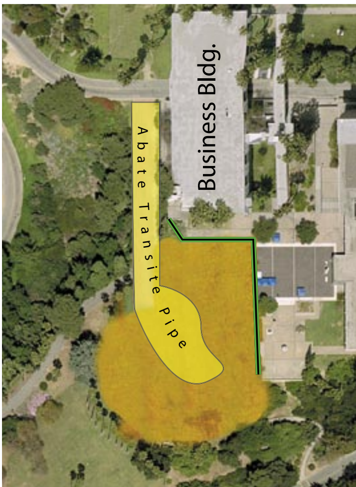
Abate Transite Pipe, Northwest of Business Bldg.

Monday 03/12/07 through Friday 03/16/07 from 7:00am to 4:00pm.